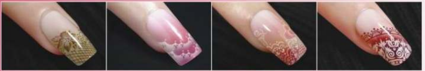
Image Photo Nail Printer V1 is a desktop nail art machine that can print various colour patterns and photos onto your nails or nail tips, with this quick and easy DIY nail printer. The printer is best suited in Beauty Parlors, Wedding Studios, Fashion Stores, Nail Salons, Hair Salons, Shopping Malls as well as used for company promotions. Opening up many new business opportunities.